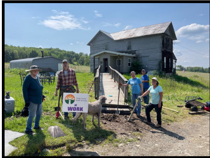
Our volunteers build ramps to improve accessibility to homes.