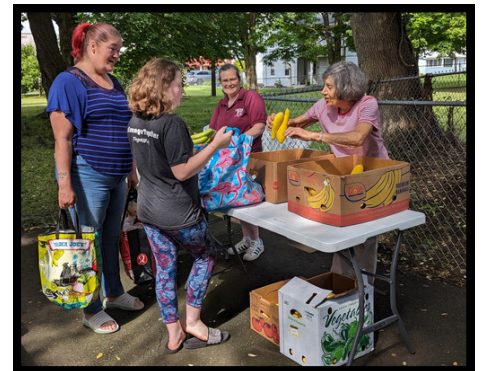
ABOVE: Our August Food Give-Away.