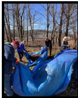
CENTER: Tri-Town Insurance employees aided our Spring Cleanup for seniors.