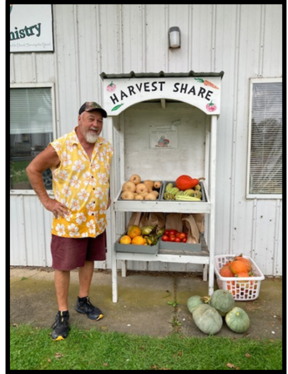
Your local farmers and gardeners supply us with fresh produce to share.