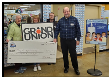
LEFT: Grand Union shoppers gave generously.