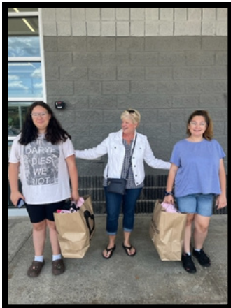
Families can receive financial assistance to buy school clothes.